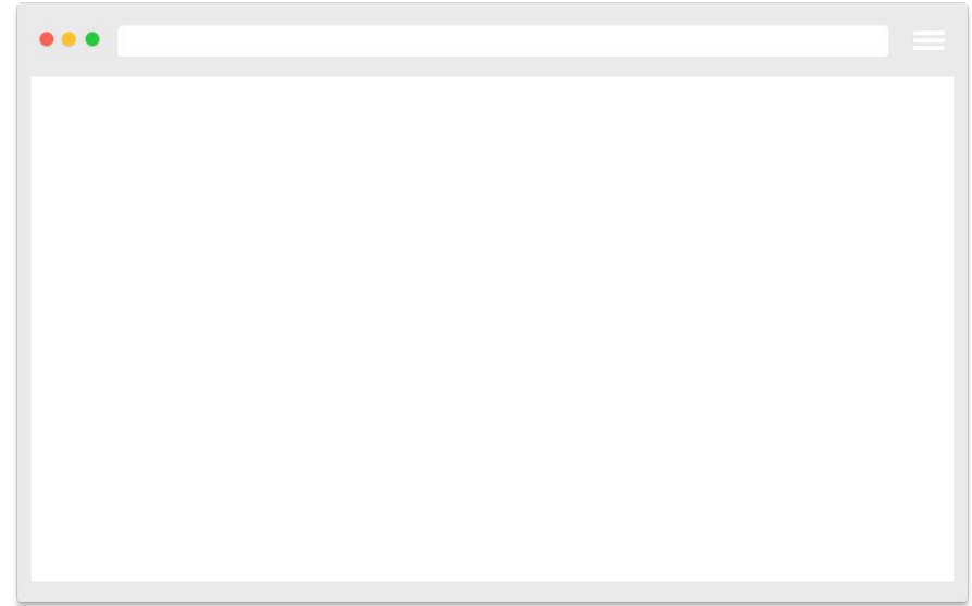
Figure 2.0 - Browser Background Template