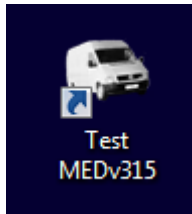
Figure 1: Shortcut Icon for Test MEDv315