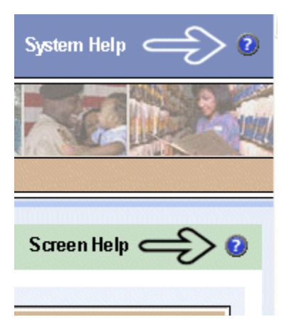
Figure 7: System Help vs. Screen Help

The overall Help is accessed by using the vert button in the upper right-hand corner of the application window, which is above the context-sensitive help button.