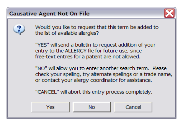
Figure 1. Causative Agent Not On File Dialog

11. Currently, there is a message or pop-up box telling an end user in CPRS that the allergy term they are searching for was not found, but that they can request that it be added (Figure 1). However, this message box is not available if a Sign/Symptom is not available. What is the desired workaround for a site to request that a Sign/Symptom term be added, since they will not have the instructions from this pop-up box?