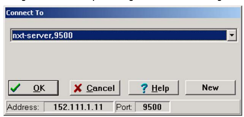
Figure 7: Server and port configuration selection dialogue

If there is more than one server/port to choose from, GetServerInfo displays dialogue that allows users to select a service to connect to, as shown in <u>Figure 7</u>: